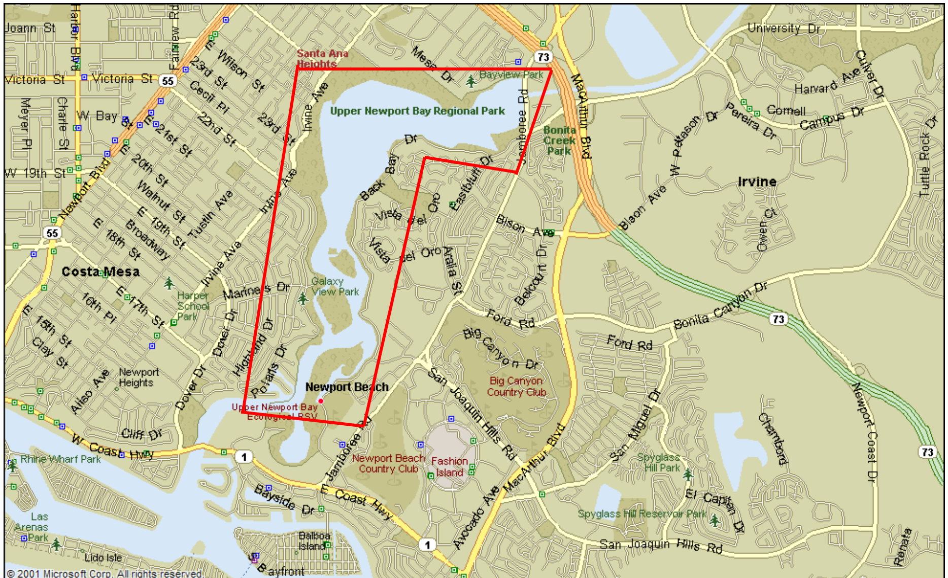
Figure 1. Study area of Upper Newport Bay.