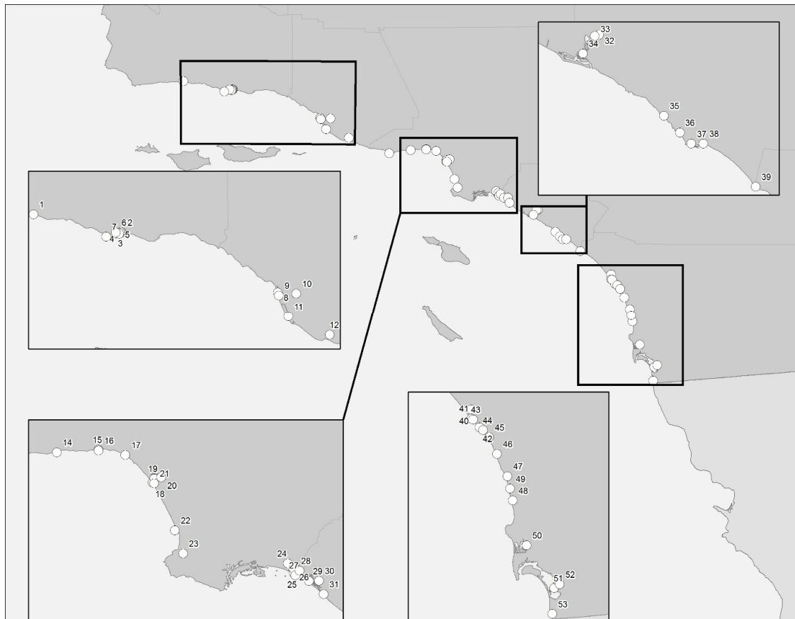
Figure 2. Map depicting fifty-three sampling locations along the Southern California Bight coastline. Santa Barbara and Ventura Counties (#1–12) 1 = Arroyo Hondo, 2 = Atascadero Creek, 3 = San Jose Creek, 4 = San Pedro Creek, 5 = Tecolotito Creek, 6 = Goleta Slough, 7 = Devereaux Slough, 8 = Ventura Harbor, 9 = Santa Clara River Estuary, 10 = Santa Clara River, 11 = Channel Islands Harbor, 12 = Calleguas Creek. Los Angeles County (#13–28), 13 = Zuma Lagoon, 14 = Malibu Lagoon, 15 = Topanga Creek, 16 = Topanga Lagoon, 17 = Rustic Creek, 18 = Ballona Lagoon, 19 = Marina Del Rey, 20 = Ballona Creek, 21 = Del Rey Lagoon, 22 = King Harbor, 23 = Malaga Creek, 24 = Colorado Lagoon, 25 = Alamitos Bay, 26 = Mother’s Beach, 27 = San Gabriel River, 28 = San Gabriel River upstream. Orange County (#29–39), 29 = Seal Beach, 30 = Huntington Harbour, 31 = Bolsa Chica Channel/Basin, 32 = San Diego Creek, 33 = Upper Newport, 34 = Back Bay, 35 = Aliso Creek, 36 = Salt Creek, 37 = Dana Point Harbor, 38 = San Juan Creek, 39 = San Mateo Creek. San Diego County (#40–53), 40 = Santa Margarita River, 41 = Oceanside Harbor, 42 = Loma Alta Creek, 43 = San Luis Rey River, 44 = Buena Vista Creek/Lagoon, 45 = Agua Hendionda, 46 = Batiquitos Lagoon, 47 = San Elijo Lagoon, 48 = Los Penasquitos, 49 = San Dieguito River, 50 = Mission Bay, 51 = San Diego Bay, 52 = Sweetwater River, 53 = Tijuana River/Estuary.

Cyanotoxin analysis was primarily conducted using ultra high performance liquid chromatography with HPLC-UV using an Agilent Infinity 1260. Separation was carried out with an Agilent Zorbax RRHD Eclipse Plus C18, 2.1 × 50 mm, 1.8 μm column (Agilent Technologies, Santa Clara, CA, USA). The method was adapted and modified from [57,73,74]. The mobile phase consisted of A: H 2 O, 0.01% TFA, B: MeCN, 0.01% TFA. The elution gradient began with 20% B from zero to 4 min, with a transition to 70% B by 4.2 min. This was followed by an increase to 95% B by 4.6 min and this was held until 5.4 min, with a subsequent decrease to 20% B by 6 min, and held for 1.5 min. The flow rate was 1 mL/min and the column was heated to 30 °C. Anatoxin-a and derivatives were considered ‘anatoxin positive’ due to lack of ion fragmentation patterns obtained from HPLC-UV