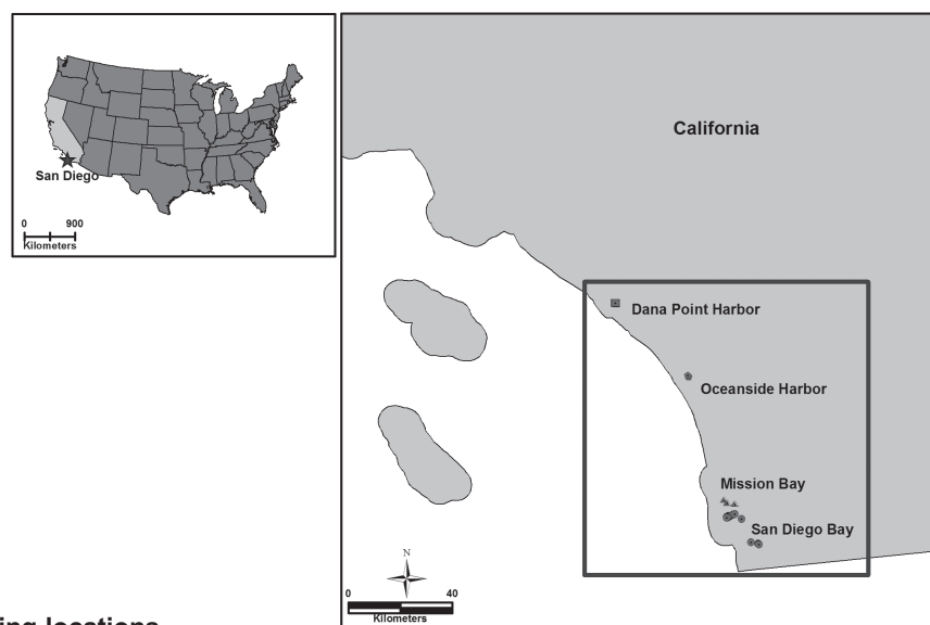
Figure 1. Sampling locations.

The chromatographic separation of antifouling compounds was achieved using an HPLC (Agilent Technologies 1100, Inc., Palo Alto, CA) and a reverse phase column (Luna C18, 5 \mu m, 100Å, 50 x 2.0 mm ID, Phenomenex) fitted with a guard column (C18 4 x 2.0 mm, Phenomenex). A binary gradient elution with 100% methanol (B) and ammonium formate buffer (A) (pH 3.9) was used. The gradient program was: 90% A, 10% B; linear to 100% B for 10 minutes,